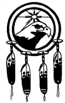
State Recognized Tribe