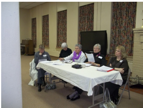
United Methodist Women listen intently at the Training Event on January 25th

I grew up in Bailey, NC, in a very fundamental Baptist church. Moving to Raleigh after high school graduation, I enjoyed the freedom of not having to go to church for a short time before I realized that I missed it and started exploring my options. I tried the Catholic Church, numerous protestant denominations, and finally settled on a non-denominational church when I moved to California in 1968. That is where I stayed until I married a Methodist pilot from California and joined him in his church. I am very happy to have found him and the Methodist Church.